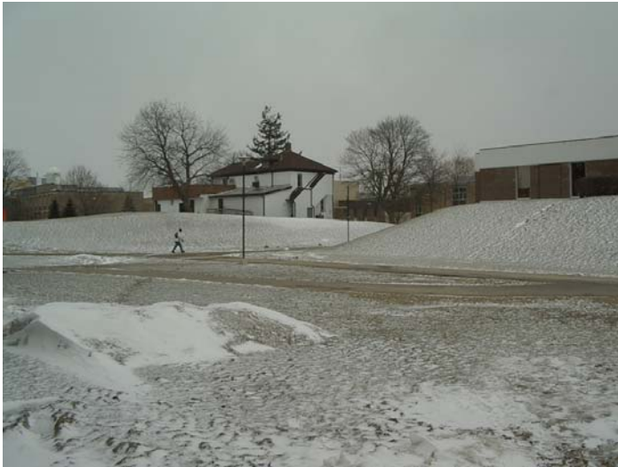
Figure 4 – Surrounding Slopes Affecting Hydrology