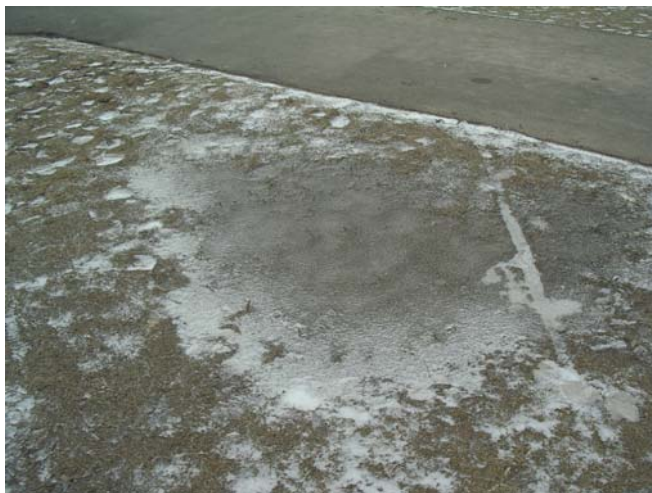
Figure 3 - Water Pooling in Depressed Areas

Topography will have an influence on microclimate and specifically surface drainage, as slopes are better drained than level areas (Harker et al., 1999). The subject site is predominantly concave, sloping inwards towards installed storm sewers, with several small depressions scattered within its area. Figure 3 illustrates the effect of these small depressions on the site, indicating that they allow for the pooling of water. However, aside from such pools that occur after major rainfall events, it is assumed that the gradual slope towards the installed storm sewers provides for an adequate level of surface runoff.