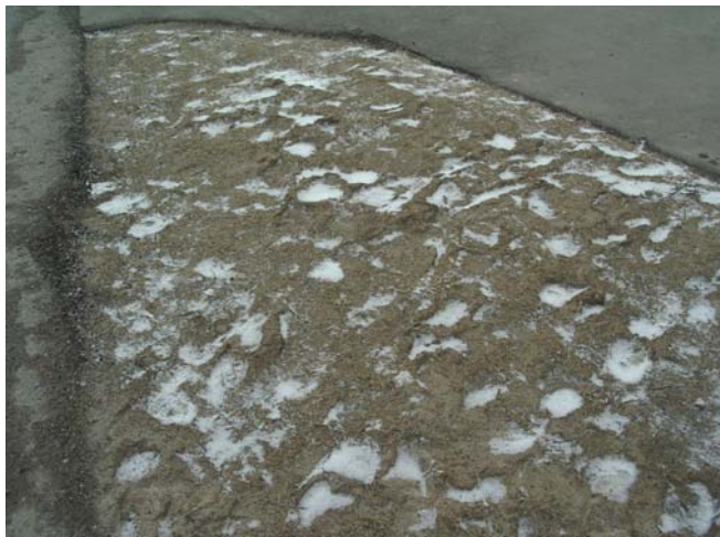
Figure 6 - Erosion as a Result of Frequent Disturbance